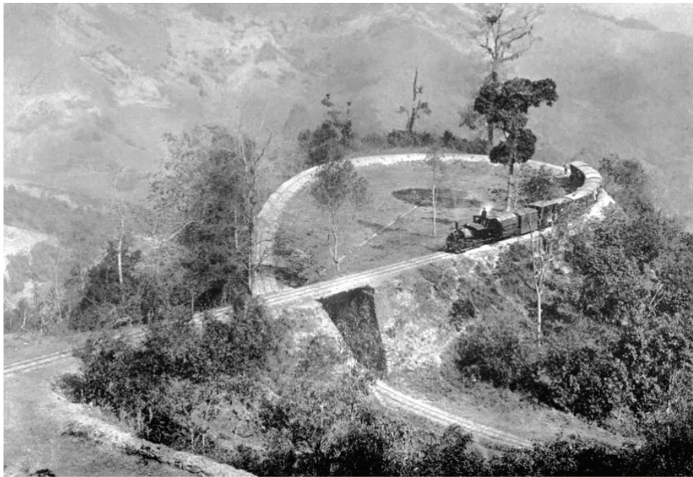
A SINGLE LOOP IN THE DARJEELING HIMALAYAN RAILWAY