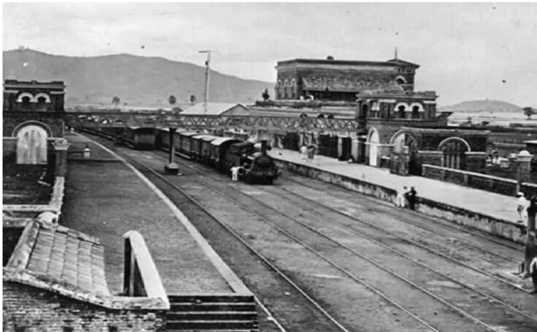
AN INDIAN STATION NEAR CALCUTTA (NOW KOLKATA)