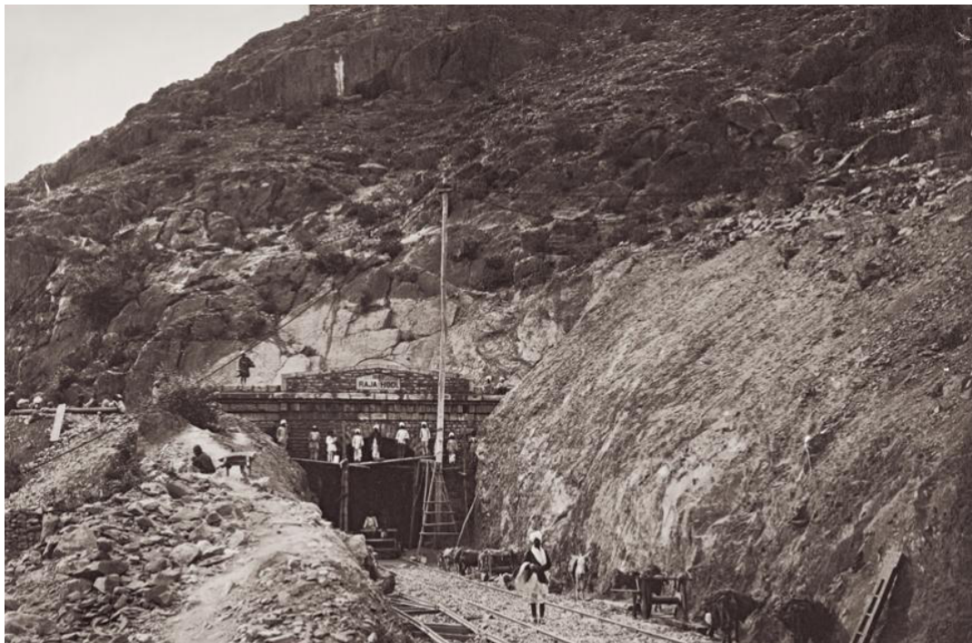
A RAILWAY TUNNEL UNDER CONSTRUCTION AT RAJA HODI, INDIA, 1883.