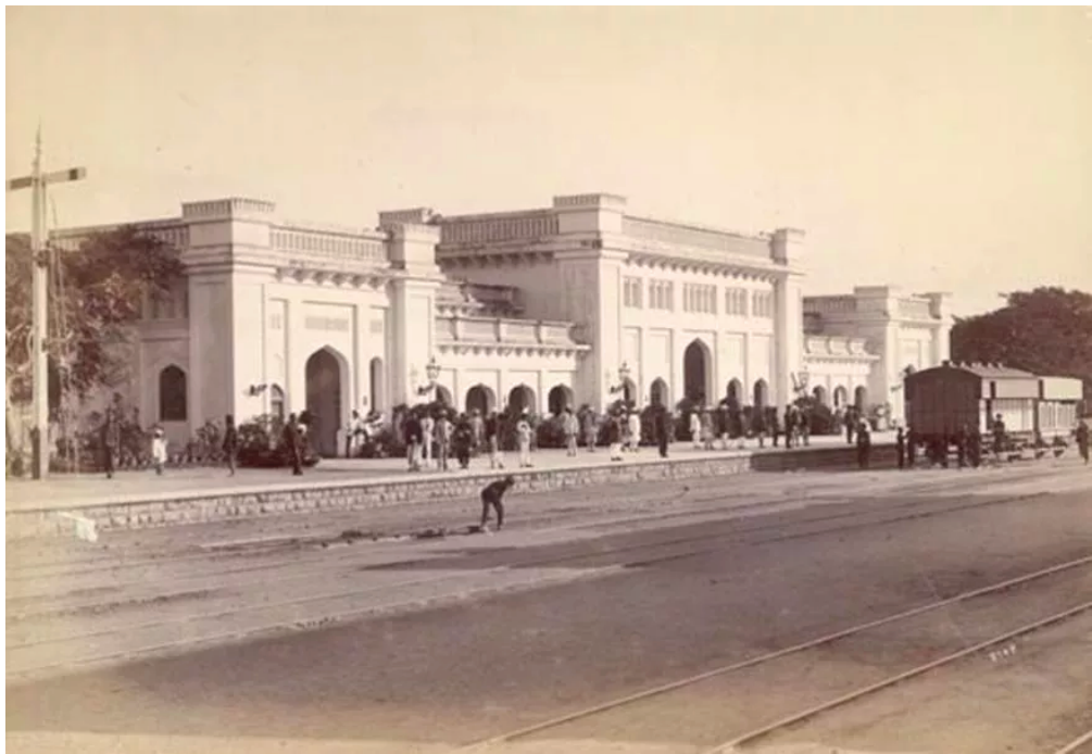
PASSENGERS WAITING ON THE PLATFORM AT HYDERABAD STATION IN INDIA.