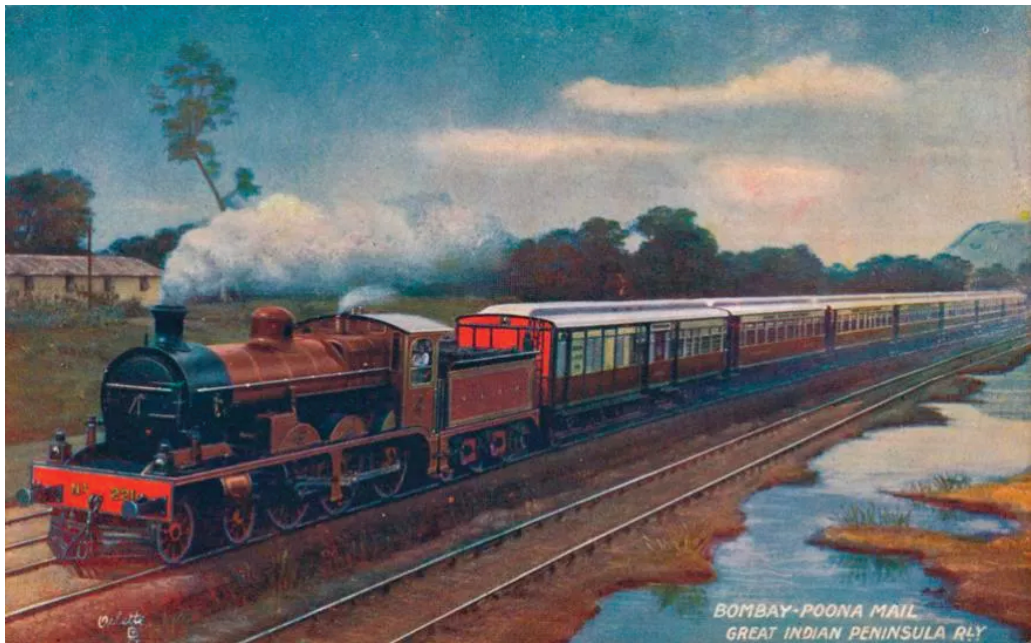
MUMBAI-PUNE MAIL (STARTED AS BOMBAY-POONA MAIL) WAS A LUXURIOUS TRAIN ON THE MUMBAI-PUNE SECTION BY THE GREAT INDIAN PENINSULA RAILWAY.