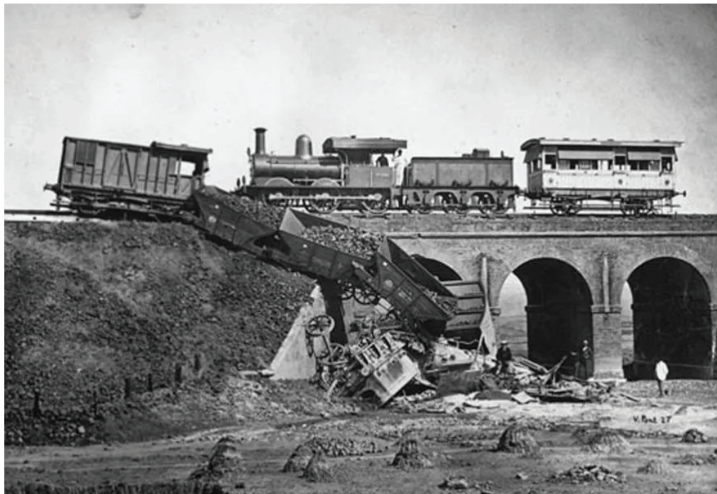
A RAILWAY CRASH ON A BRIDGE IN INDIA.