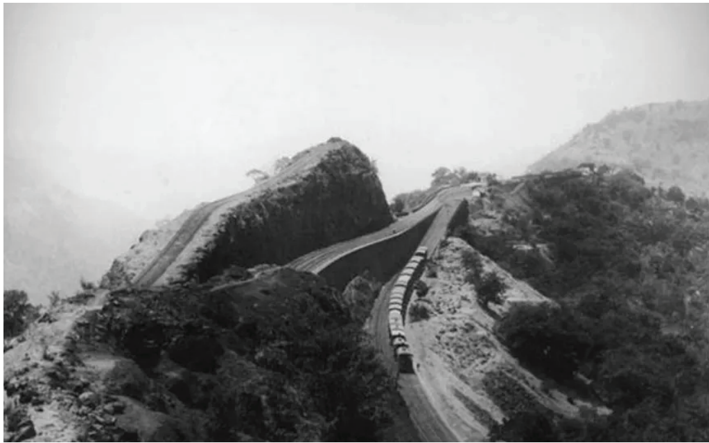
A RAILWAY REVERSING STATION ON THE BHORE GHAT INCLINE, NEAR THE TOWN OF POONA OR PUNE IN MAHARASHTRA ON THE