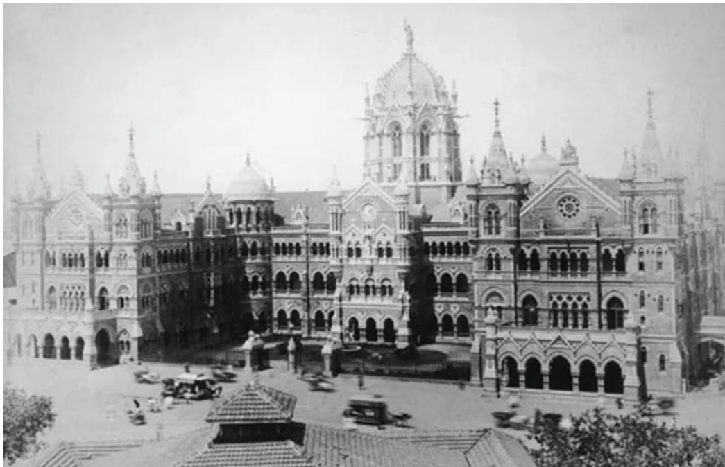
A VIEW OF VICTORIA STATION, MUMBAI (BOMBAY). BUILT-IN 1888 TO A DESIGN BY FREDERICK WILLIAM STEVENS, IT IS NOW KNOWN AS THE CHHATRAPATI SHIVAJI TERMINUS.