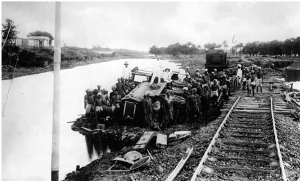
A TRAIN DERAILMENT DURING TRACK-LAYING IN INDIA.